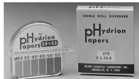
Catalogue #3524 & #3525